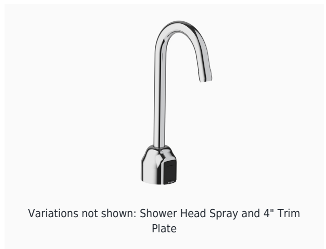
Variations not shown: Shower Head Spray and 4" Trim Plate